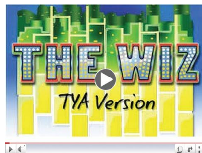
The Wiz - Promo Video

The Youth on Stage program will present The Wiz this weekend: Friday, Dec. 4 at 6:00 pm and Saturday, Dec. 5 at 1:00 pm at the War Memorial. Tickets only $10! Based on the original Tony-Award winning Broadway musical, The Wiz tells the story of Dorothy's tornado-driven adventure in Oz, and the wonderful characters she meets along the yellow brick road: the Tin Man, the Scarecrow and the Cowardly Lion. "Ease on Down the Road," with the toe-tapping music of a modern classic, is included in this Theatre for Young Audiences version. BUY TICKETS