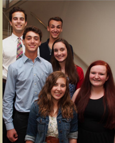
2015 Scholarship Winners!

We are so proud of our scholarship program, the impact it has had with so many young people, and the pride it gives our organization. Please contribute!