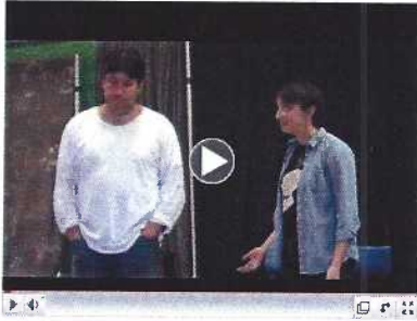
Grosse Pointe Theatre Presents: "A View from the Bridge" Nov. 2014